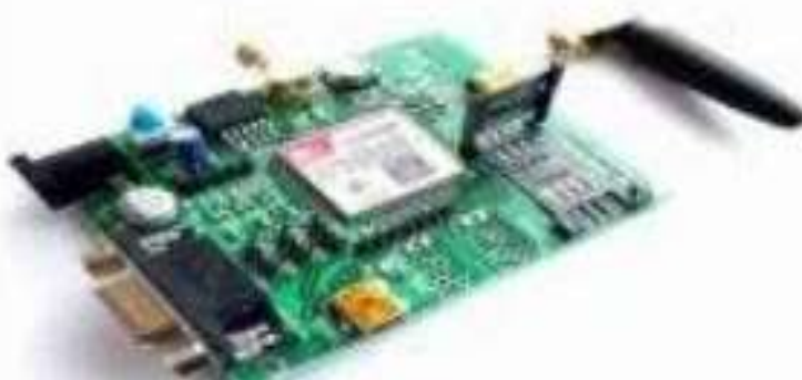
Fig. 2: GSM Module.

Global System for Mobile communication is a standard accepted worldwide for mobile communication. GSM/GPRS module is used for establishing communication link between a computer and a GSM-GPRS system. GSM is an architecture used for mobile communication in number of countries in the world. GPRS (Global Packet Radio Service) is an addition of GSM. It allows higher data transmission rate for the well-organized communication purpose. GSM/GPRS component consists of a GSM/GPRS modem assembled together. It is assembled among power supply circuit and communication interfaces like RS-232, USB, etc. for users computer. We are using Sim800 in our system. The image of GSM module is shown in Fig. 2 .