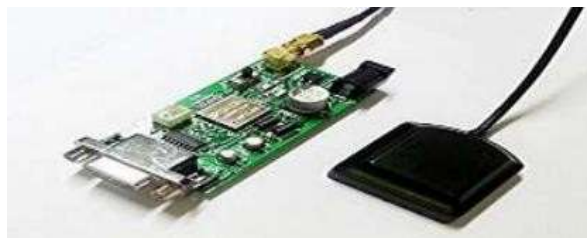
Fig. 1: GPS Module

GPS is one of the trendy systems in communication. Global positioning system technology became a reality throughout the efforts of military of the American. It recognized a satellite-based navigation system consisting of a network of group of satellites orbiting the earth. There are 24 satellites in a system. GPS is also acknowledged as the NAVSTAR. It operates all across the world. It works in all weather conditions. It helps users to track locations as well as objects. By using GPS technology we can track each entity having GPS receiver. Consequently we can say that the GPS technology can be used by any person having GPS on the earth. The image of GPS module is shown in Fig. 1 .