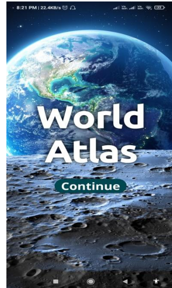
Fig: Home Page

This project can also be enforced in class and Faculties. and might established in associative android device to urge complete data and details of a specific country.