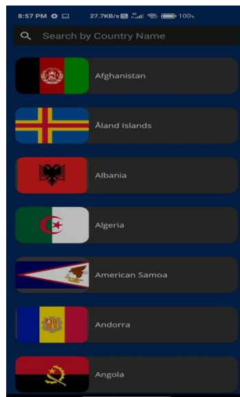
Fig: User Interactive mode