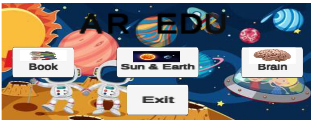
Fig 2. Home Page

The home page of our app consists of four sections from which you can choose from: Book, Sun & Earth, Brain and Exit.