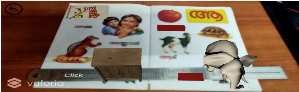
Fig 3. Elements in a Book

This page of book contains 3 instances of the 3D images, video and audio. We make use of the virtual buttons which can be seen as the red rectangular boxes. When you place your fingers or any other item, in this case the scale, covering the red mark, the 3D elements pop up. The first one is the Malayalam alphabet (A) on the top left corner of the book. This is an audio element where it recites the wordings “a for amma”. The next one is the cupboard which is a 3D image. The last one is the elephant which is a 3D video element. So, when you place that ruler or any other item over the red virtual button, the elephant video pops up. It’s a video of elephant walking in the above image.