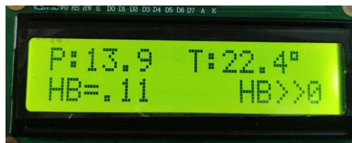
Figure 3: LCD displaying all the three values P=> Ph value, T=> Temperature, H=> Heartbeat per second

Figure 2 shows that at the start of the new test the Liquid Crystal Display Displays to scan the card with RF-ID reader to authenticate the patient. Also, the RF-ID cards of the patients are updated after each test. The figure 3 shows all the three test readings at the same time on an LCD display. Also if these values vary too much the message is forwarded to the local doctor and an ambulance services can also be contacted as an emergency.