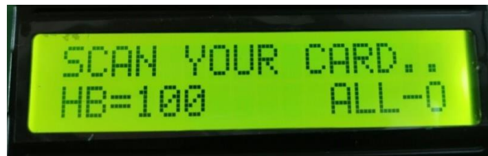
Figure 2: LCD Showing to scan the RF-ID card