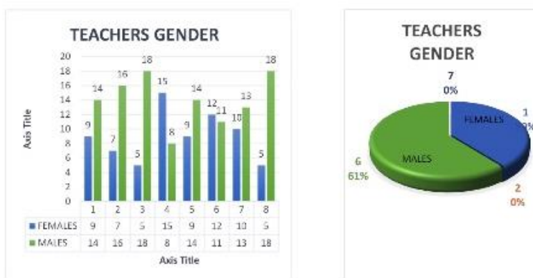
Fig. 2: Gender of Teachers