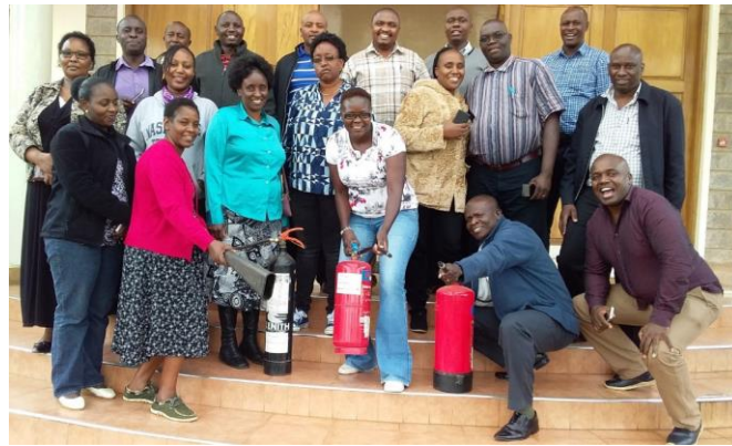
Figure 1: TSC fire marshals under training

According to TSC updates on fire Safety and regulation measures: Training should be intensified on how to manage on emergency evaluation and fire drills; a facilitator should be invited to schools to train both teachers and students on how to handle minor accidents before they worsen and how to put off fire; cooling fuel, removing heat, cutting off oxygen supply using foam CO 2 , removing fuel, stopping by applying chemical powder and using fire alarms and exits.