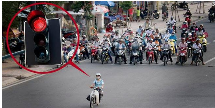
Fig. 2: People in traffic passing red lights

There are many people in traffic who do not care about their own lives and those of others. In addition to overcoming the red light, learning is fast, reckless and wriggling. Even many people drink beer and wine still join the pine. There have been cases where an accident has resulted in injury or death (Figure 3). Motorcyclists after drinking are the culprits responsible for 90% of traffic accidents, nearly 70% of people who "drink" still risk driving (Traffic newspaper, 2019). It is the result of the research group's influence on the alcohol content on the safety level of motorbike drivers in Vietnam.