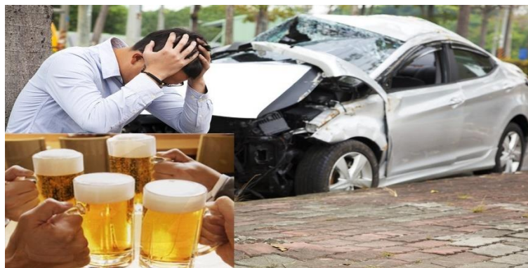
Fig. 3: Accidents caused by drinking beer or alcohol

The team said, according to traffic police statistics, the number of traffic accidents related to the alcohol concentration of 4%, in Ho Chi Minh City at 5% and Binh Duong province is 12%. However, this figure is much lower than the statistics of traffic accidents caused by alcohol and hospitalization in some hospitals (Traffic newspaper, 2019). The underlying cause of the difference is that in many traffic accidents, the trauma status of the victim has made it difficult for alcohol testing. Men cause 80% - 90% of traffic accidents due to drinking beer, alcohol, accidents in the evening (18h-24h) and higher on weekends. Motorcycles cause 70% - 90% of traffic accidents due to drinking beer or alcohol (Traffic newspaper, 2019).