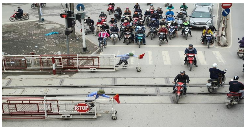
Fig. 1: Encroaching on a lane in road traffic

Currently, a large part of people in traffic only obeys the provisions of the law in the field of traffic when there is a traffic police force. On the contrary, these people are willing to cross the red light, encroach on the road, cross the road, park the car on the crosswalk, etc (Figure 2) Therefore, the top requirement is to strictly handle violations of the Traffic Law roads with sufficient deterrence. In addition, in the current situation, when the traffic police force cannot "cover" patrol work on all roads, it is necessary to increase sanctions through technical means such as cameras. According to traffic experts, the "fines" implemented over the past few years have contributed to raising the awareness of road users. This form of impact directly and strongly on the awareness of pedestrians, highly deterrent when making them feel always being monitored by cameras during traffic. Next, the radical solution is to improve the effectiveness of propaganda and mobilize people, need to create new forms of propaganda and bring more practical effects.