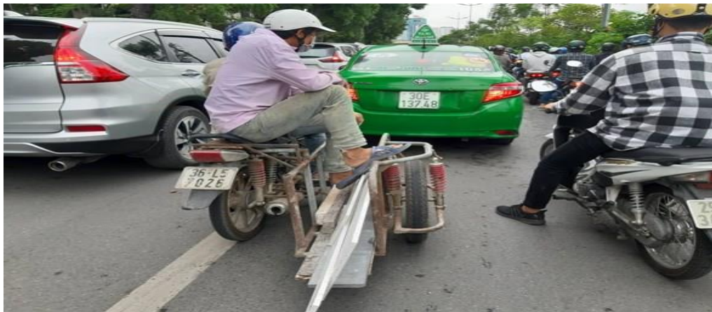
Fig. 5: Road users are not safe

The business situation of transporting passengers on the routes freely and spontaneously, without strict organization, so it often happens that reckless overtaking to scramble guests, cramming passengers ... has happened. Many catastrophic traffic accidents (figure 5). Thus, it must be said that the awareness of people in traffic and vehicle control when participating in traffic is not high, along with a lack of understanding of the law, is one of the main causes of congestion and increasing traffic accidents.