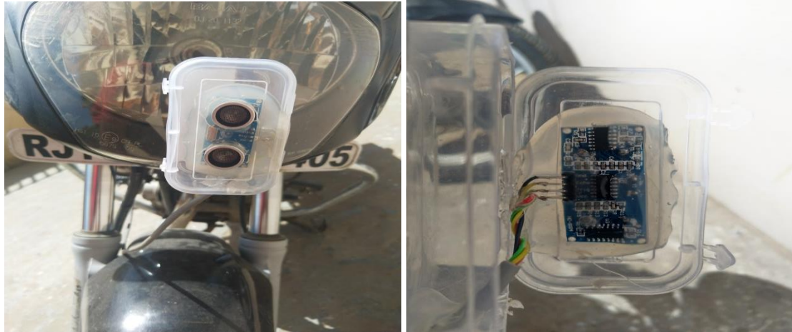
Fig. 1: Ultrasonic sensor and MC Unit mounted on a motorbike

G.L. Gissinger (2002) describes a new Intelligent Braking system for motor vehicles. A mechatronic approach helped to avoid some drawbacks found in the conventional system. The Brake was designed according to the “full contact disc brake” principle. Indeed to provide better control, the regulator uses feedback information not only from slip but also from the braking torque.