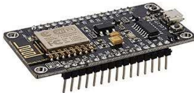
Fig. 3: NodeMCU

NodeMCU is an open source Lua based firmware designed for the ESP8266 WiFi SOC from Espressif and uses an on-module flash-based SPIFFS file system. It is implemented in C and is layered on the Espressif NON-OS SDK. The firmware was initially developed as a companion project to the popular ESP8266-based NodeMCU development modules, but the project is now community-supported, and the firmware can now run on any kind of ESP module.