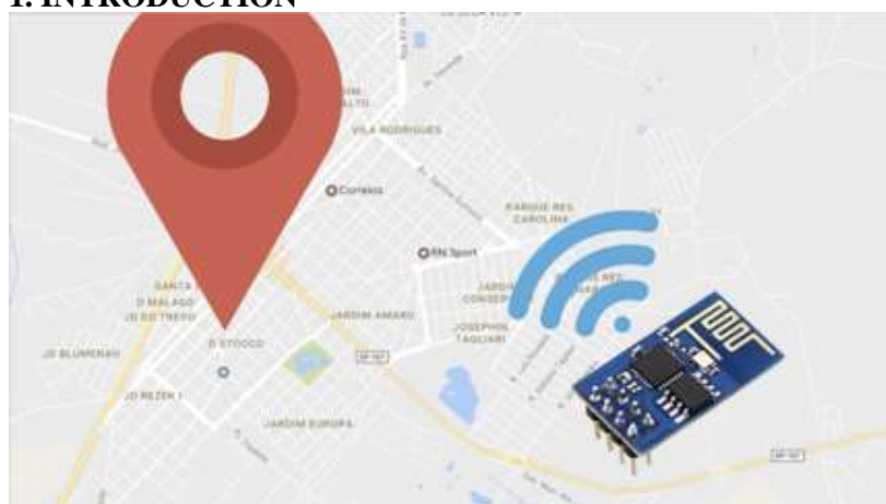
Fig. 1: Geolocation symbols

Geolocation is defined as the process of finding, determining and providing the exact location of a computer, networking device or equipment. It enables us to view the device location based on geographical coordinates and measurements.