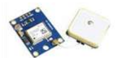
Fig. 4: GPS Module

The NEO-6 module series is a family of stand-alone GPS receivers featuring high-performance u-blox 6 positioning engine. These flexible and cost-effective receivers offer multiple connectivity options in a miniature 16 x 12.2 x 2.4 mm package. The compact architecture, power and memory options make the NEO-6 modules ideal for battery operated mobile devices with limited cost and space constraints. Innovative design and technology suppresses jamming sources and mitigates multipath effects which give NEO-6 GPS receivers excellent navigation performance even in the most challenging environments.