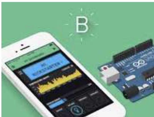
Fig. 5: Blynk app

Blynk is a platform for iOS and Android apps to control Arduino, Raspberry Pi, and other IoT components. It's majorly a digital dashboard where you can build a graphical interface for your project by simply dragging and dropping widgets. Blynk is not interfaced to some specific board or shield. Instead, it supports the hardware of your choice. Whether your Arduino or Raspberry Pi is linked to the Internet over Wi-Fi, Ethernet or ESP8266 chip, Blynk will get you online and ready for execution. Major IOT projects have been made using this app as it provides a user-friendly environment.