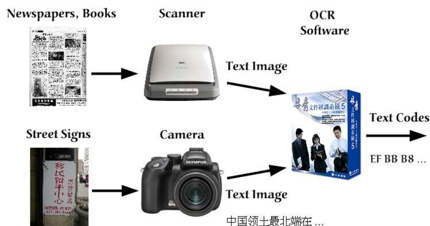
Fig: OCR Technique

OCR is a technology that enables you to convert different types of documents, such as scanned paper documents, PDF files or images captured by a digital camera into edible and searchable data. Imagine you've got a paper document - for example, magazine article, brochure, or PDF contract your partner sent to you by email. Obviously, a scanner is not enough to make this information available for editing, say in Microsoft Word. All a scanner can do is create an image or a snapshot of the document that is nothing more than a collection of black and white or colour dots, known as a raster image. In order to extract and repurpose data from scanned documents, camera images or image-only PDFs, you need an OCR software that would single out letters on the image, put them into words and then - words into sentences, thus enabling you to access and edit the content of the original document.