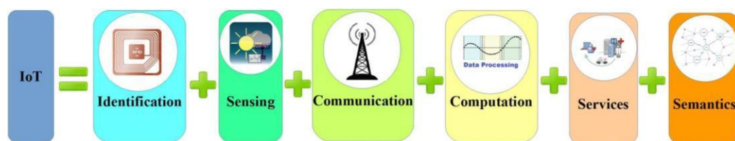
Figure 1. Building Blocks of IOT for IFHI

The key feature in IoT is, without doubt, its impact on everyday life of potential users. IoT has remarkable effects both in work and home scenarios, where it can play a leading role in the next future (assisted living, health, agriculture, smart transportation, etc. ). Important consequences are also expected for business ( e.g. logistic, industrial automation, transportation of goods, Agriculture monitoring, security, healthcare monitoring etc. ). The elements in IoT [4-5] environment are presented in Figure1. Specifically, there are six building blocks in IoT such as identification, sensing, communication technologies, computation, services, and semantics.