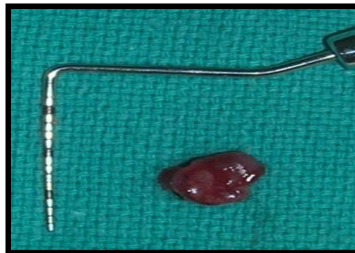
Fig 3: excised lesion