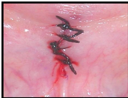
Fig 5: interrupted sutures placed