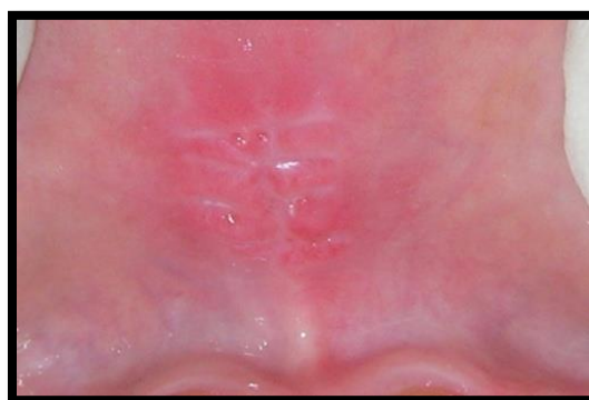
Fig 6: completely healed site after 15 days