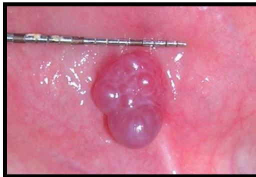
Fig 2: horizontal dimension of lesion